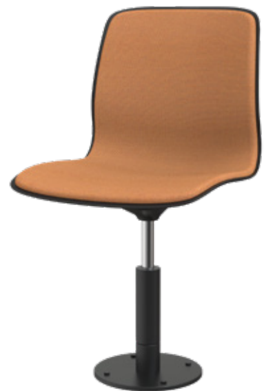
GATE REFLECT 5700