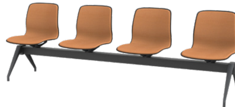
GATE REFLECT BENCH WITH FOUR SEATS