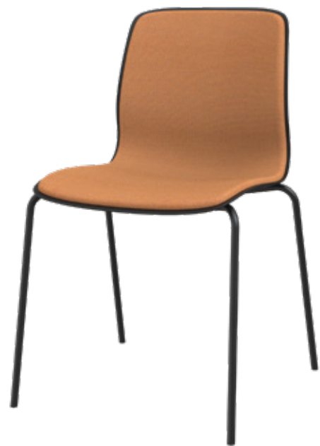
GATE REFLECT 5000