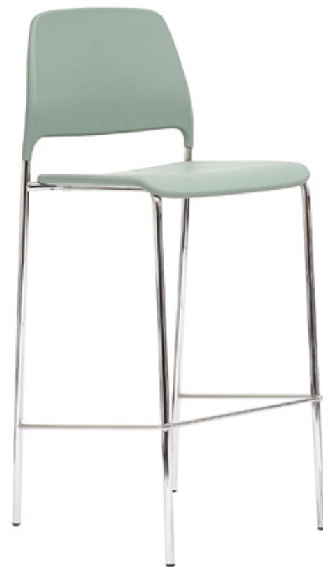
BEAT 4170 COUNTER