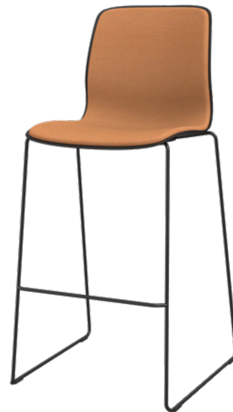
GATE REFLECT HIGH 5280