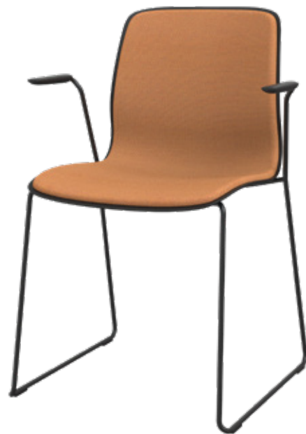
GATE REFLECT 5200 WITH ARMRESTS