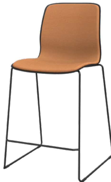
GATE REFLECT COUNTER 5270