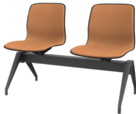
GATE REFLECT BENCH WITH TWO SEATS