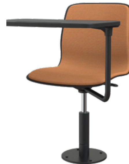
GATE REFLECT 5700 WITH WRITING TABLET