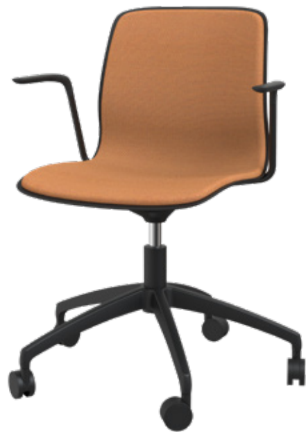
GATE REFLECT 5500 WITH ARMRESTS