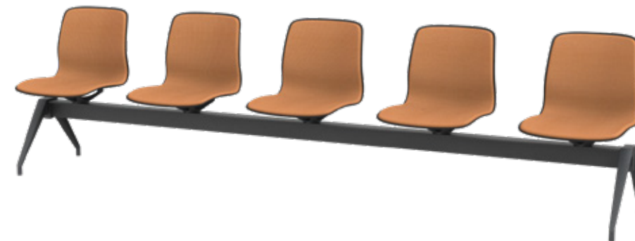
GATE REFLECT BENCH WITH FIVE SEATS