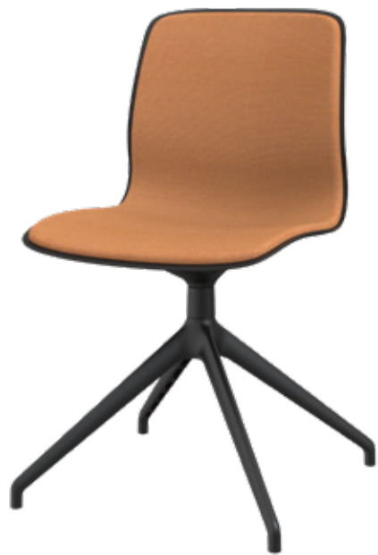
GATE REFLECT 5101