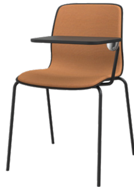
GATE REFLECT 5000 WITH WRITING TABLET