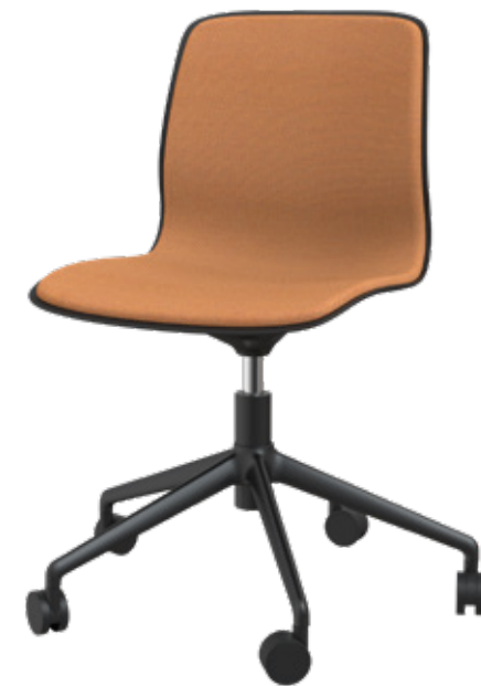
GATE REFLECT 5101 WITH 5 WHEELS