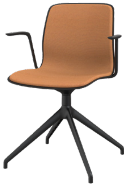
GATE REFLECT 5101 WITH ARMRESTS