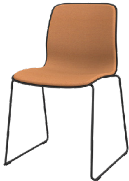
GATE REFLECT 5200