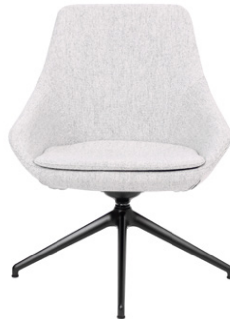
GATE 1144 LOUNGE