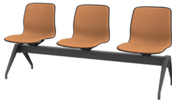
GATE REFLECT BENCH WITH THREE SEATS