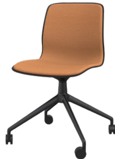
GATE REFLECT 5101 WITH 4 WHEELS