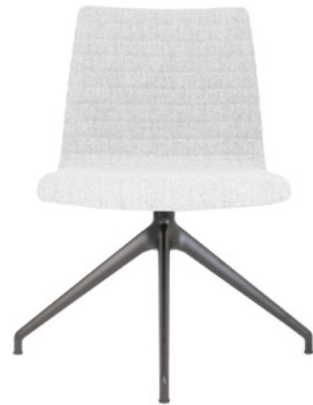
GATE 1104 LOUNGE