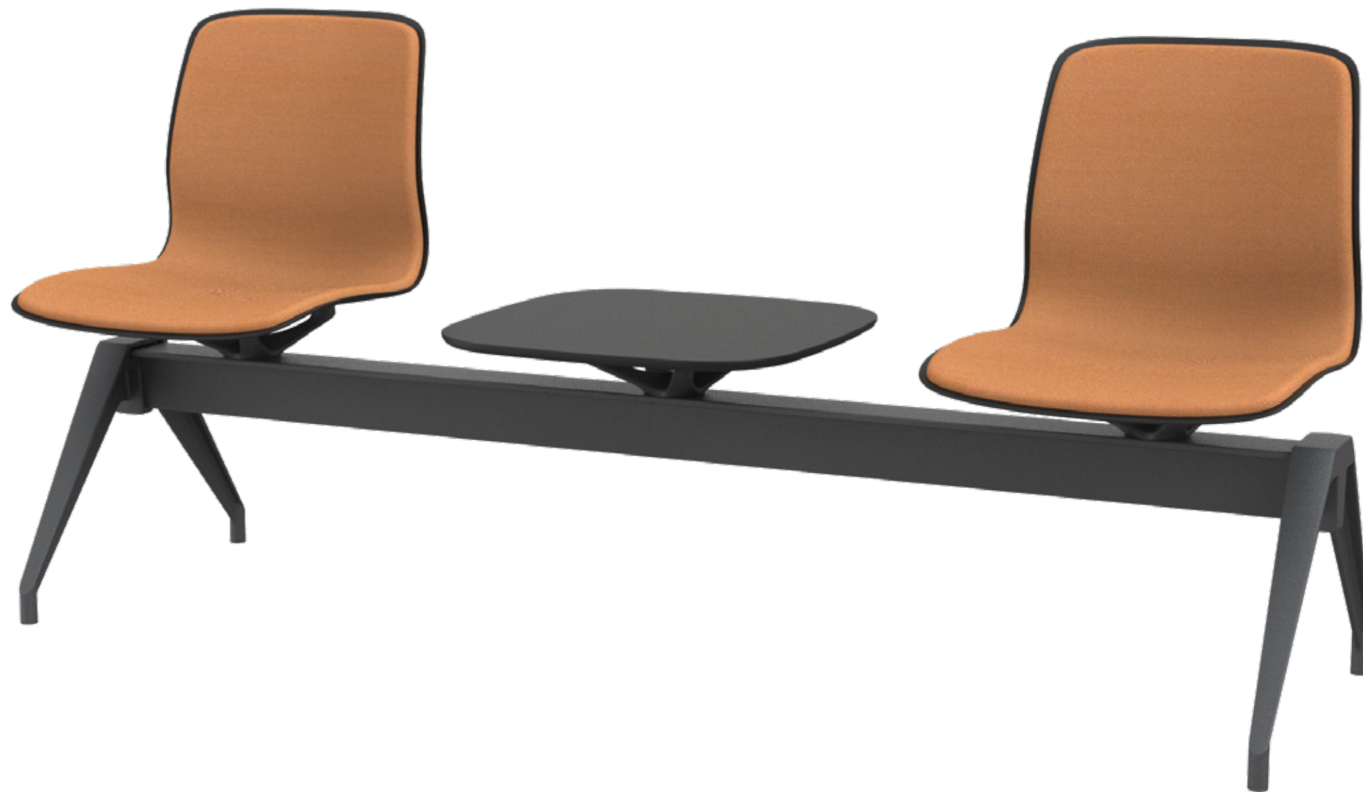
GATE REFLECT BENCH