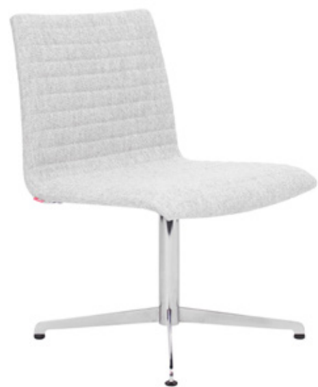
GATE 3000-N LOUNGE