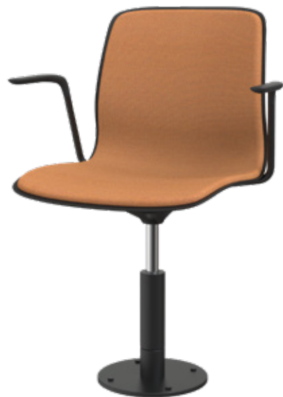
GATE REFLECT 5700 WITH ARMRESTS