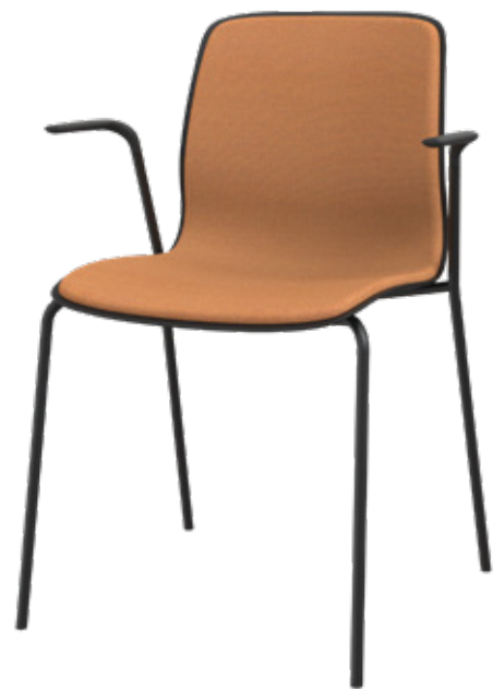
GATE REFLECT 5000 WITH ARMRESTS