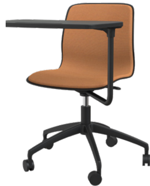
GATE REFLECT 5500 WITH WRITING TABLET